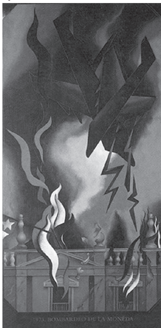
Figure 2. Frieze 1973. Bombardeo de La Moneda

Laclau and Mouffe 1985). Through discourse, empirical objects, events and identities are constituted as discursive objects. Empirical discourses, such as those exemplified by the opposed interpretations of the 11 of September 1973, constitute historical frameworks of meaning constructed in contingent and conflictive political processes. Despite this, each discourse has a relatively "unified and coherent organization of meaning" (Sayyid & Zac 1998: 260). The September 11, 1973 event is discursively constructed either as the tragic end of Chilean democracy or as the nation's liberation from Marxism. Consequently, representations of this event in pictures or paintings depend on the structuring function of the discourse that signifies it.