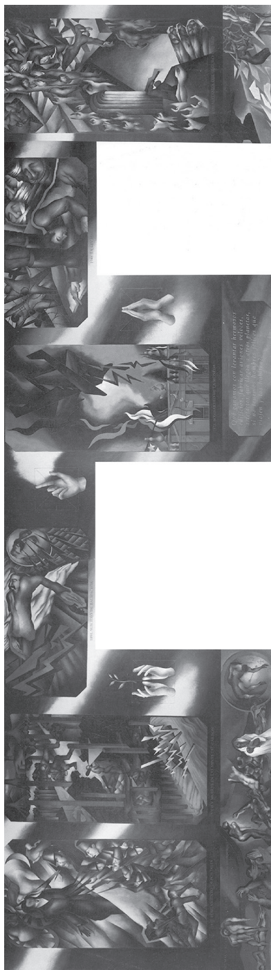
Figure 1. Panel Los Conflictos